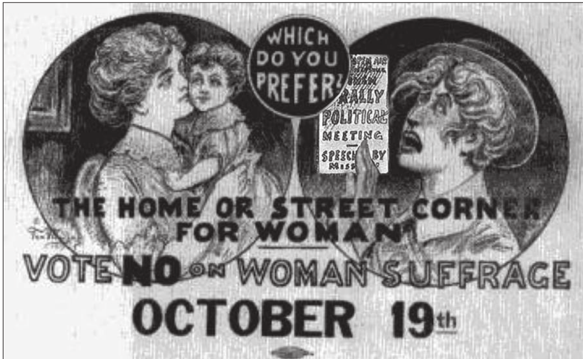
A poster produced for a referendum on women's suffrage held in New Jersey on October 19, 1915.