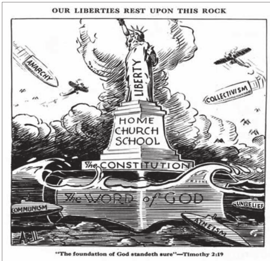
A cartoon depicting the place of religion in American society during the 1950s, published in a religious magazine.