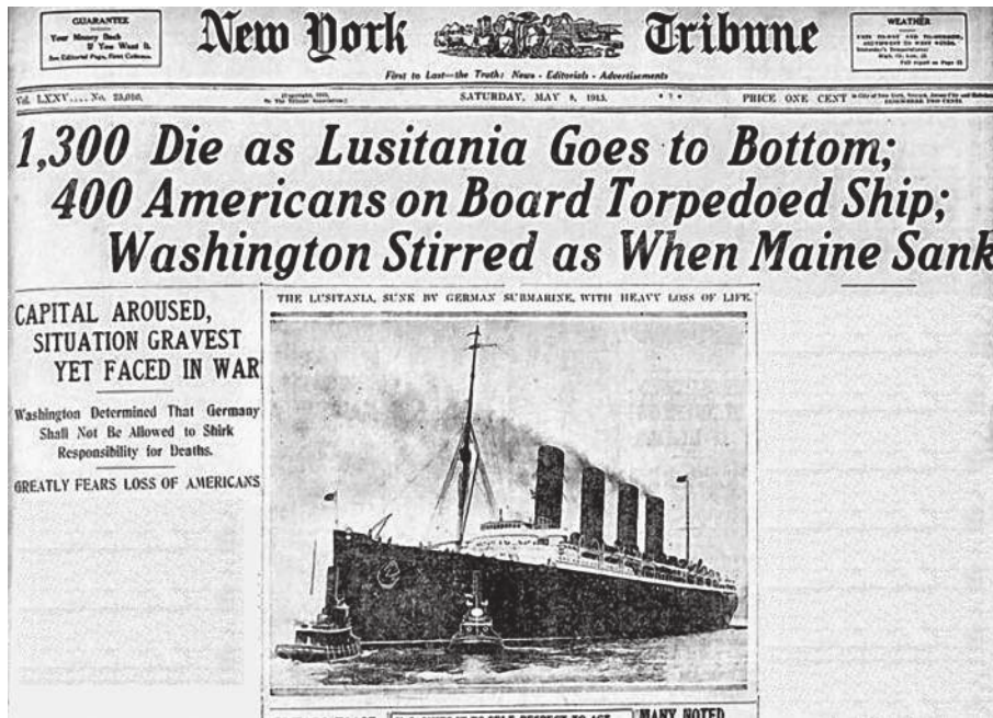
Front page of the “New York Tribune,” May 8, 1915.